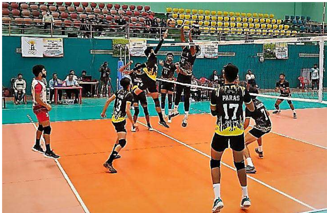
An action moment of match between Jharkhand and Chandigarh Men teams