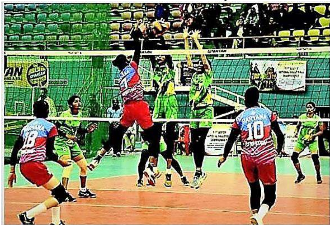
A moment of action during the match between Karnataka and Haryana women teams