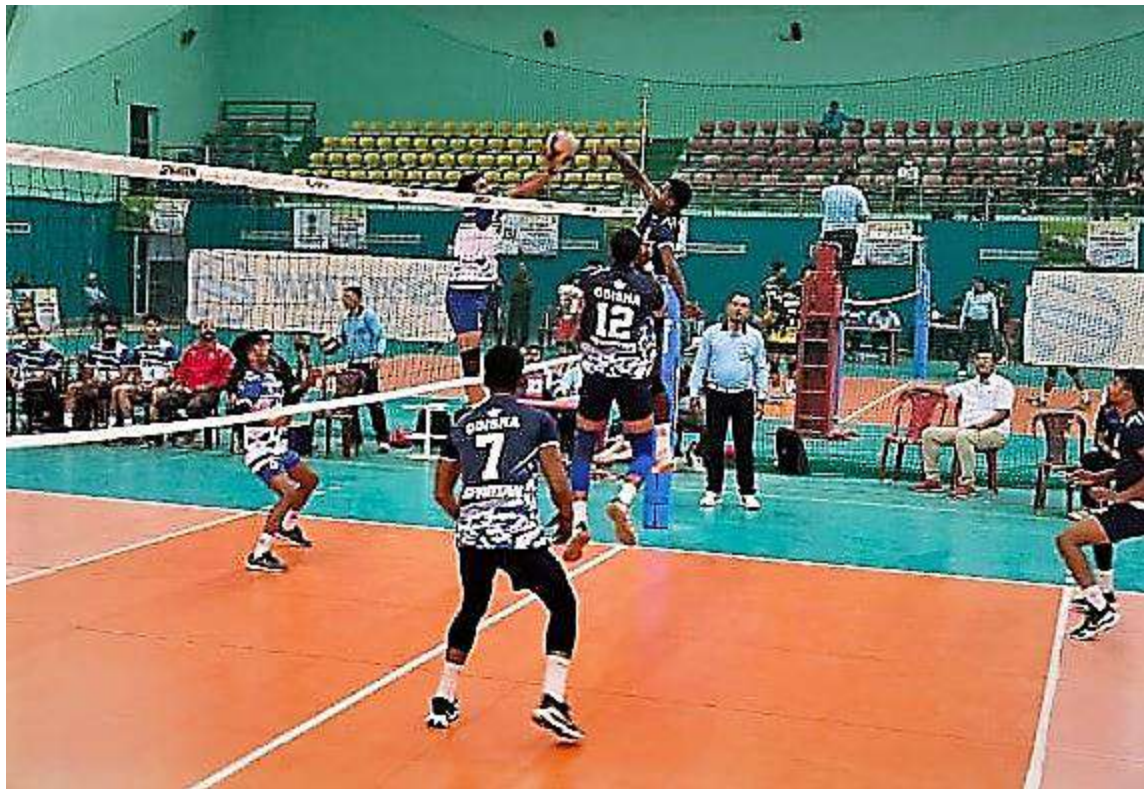
An action moment in the match between Delhi and Odisha Men Teams